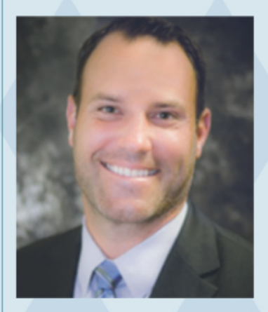
April 27, 2021 Dear Fellow Shareholder:

2020 was undoubtedly one of the most challenging times in any of our lives from a personal and professional standpoint. At Penn National Gaming, we endured unprecedented changes to our business, created and implemented comprehensive new COVID-19 health and safety protocols to help keep our team members and guests safe, and withstood a series of natural disasters that damaged several of our southern properties and left many of our team members displaced in the midst of the ongoing pandemic.